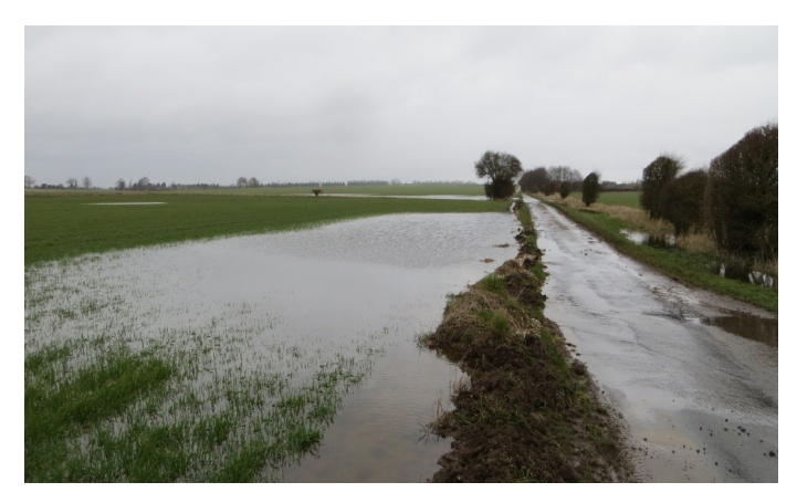
Plate 1 Groundwater flooding near Blewbury (Berkshire) February 2014.