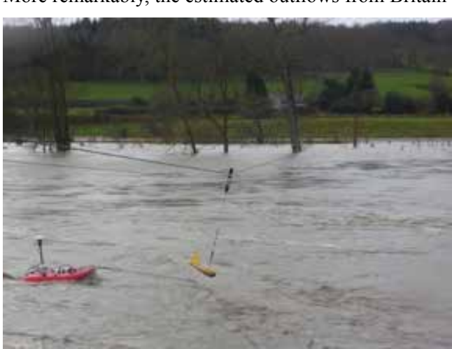
Gauging (ADCP) on the River Tyne, December 2015.

More remarkably, the estimated outflows from Britain on